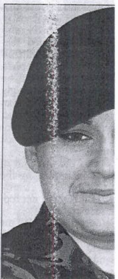
■ PART OF A TEAM: Re