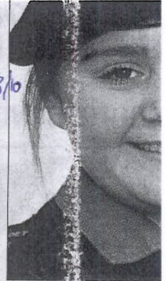
■ ALWAYS LEARNING:

They have 131,000 members, led by 25,000 adults, across the country.